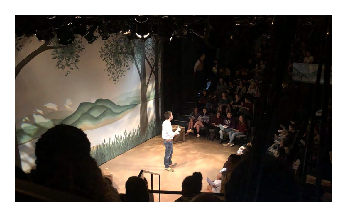
I'll know the performance is about to begin when the lights dim around me and someone on stage makes an announcement. After the announcement there will be music and I'll know the play is about to start.