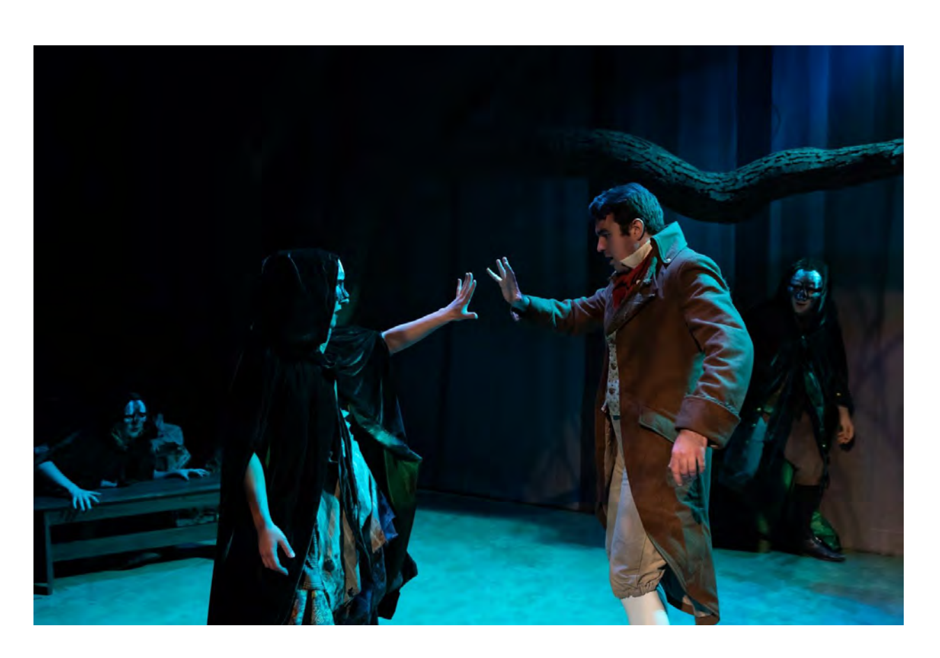
The play is about 40 minutes long. If at any point during the show I think something is funny I can laugh. If I ever think the actors did a good job I can clap. I'll know the play is over because people around me will start clapping their hands I can clap too if I want. Then the lights will come all the way back up.