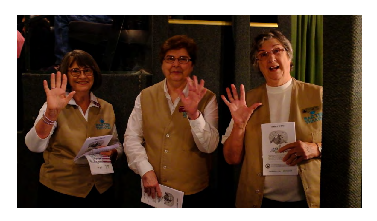
If at any point during the show I have a question or want to leave, I will ask for help quietly. There will be ushers who can help me, too. An usher is someone in a tan vest who works at the theatre.