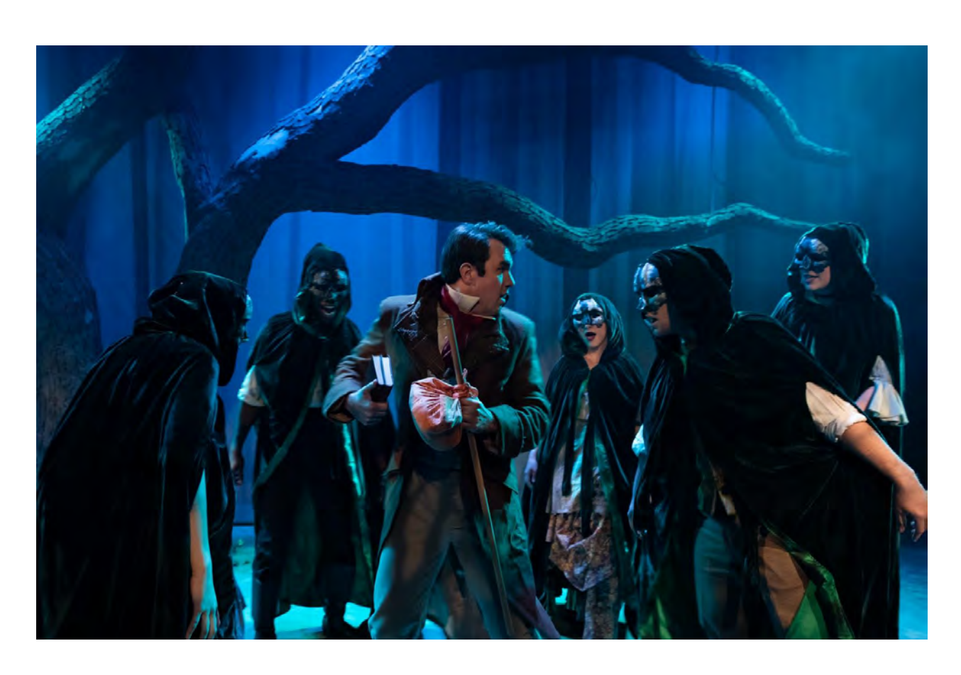
The play starts in the forest of Sleepy Hollow. Many spirits sing about the hauntings in Sleepy Hollow. Ichabod Crane then enters the forest and is frightened by the spirits.