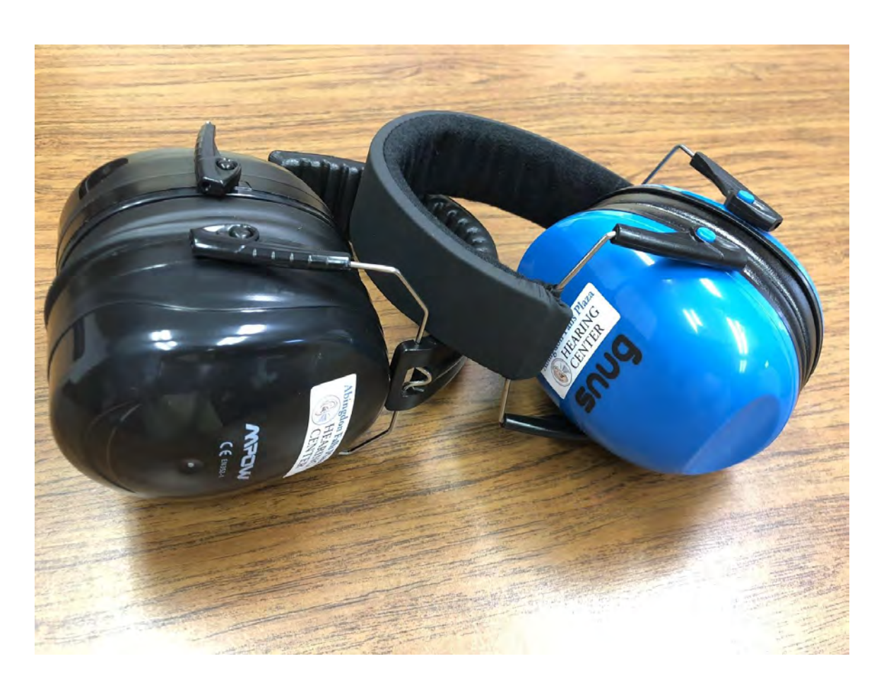
If anything ever gets too loud I can put on my ear protection or cover my ears with my hands.