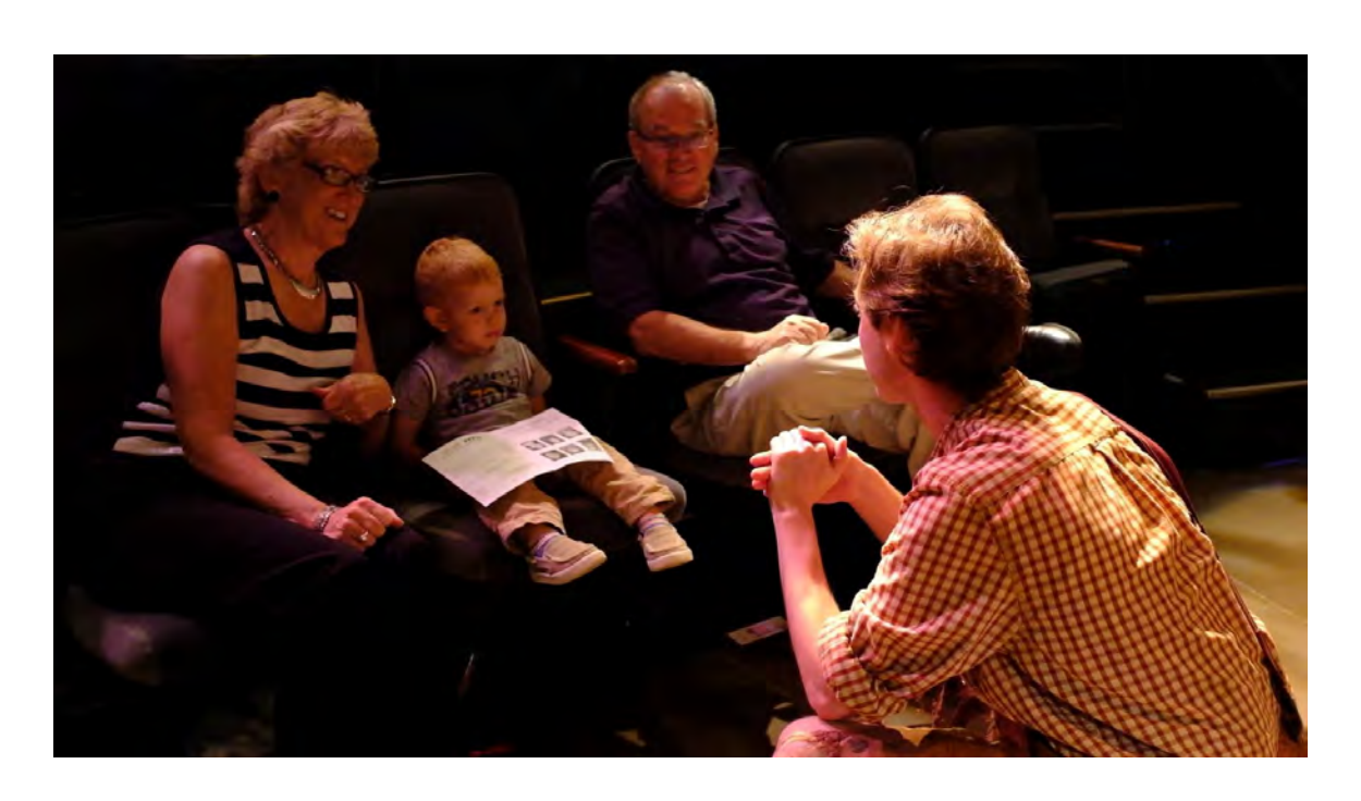
Just before the performance begins, some of the actors will come out into the audience and talk to some of the audience waiting. I might get a chance to talk to one of the actors before the show.