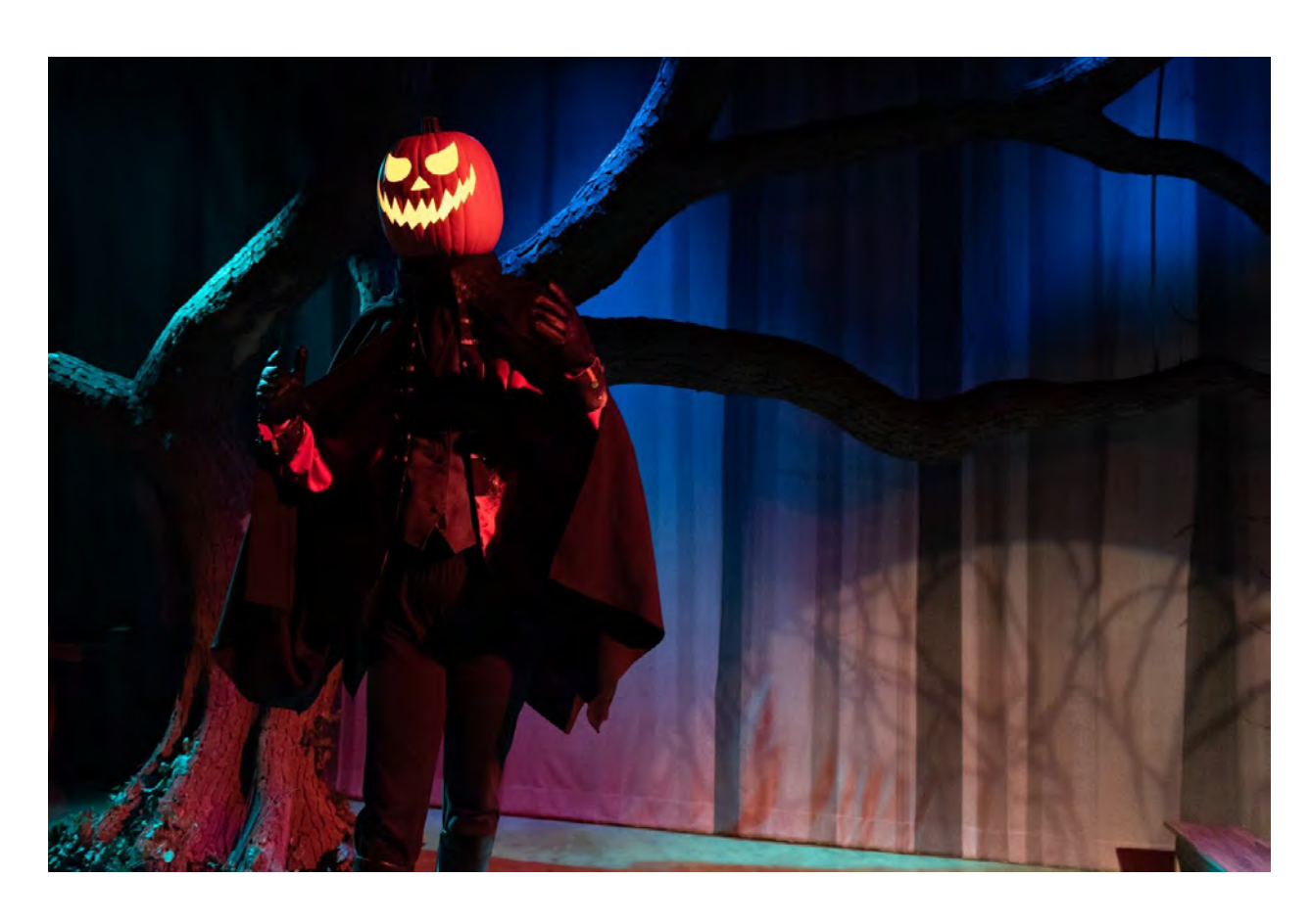
The real Headless Horseman walks toward them, and the humans quickly escape. Ichabod then runs into the Headless Horseman. The spirits reappear and watch the Headless Horseman chase Ichabod deeper into the forest.