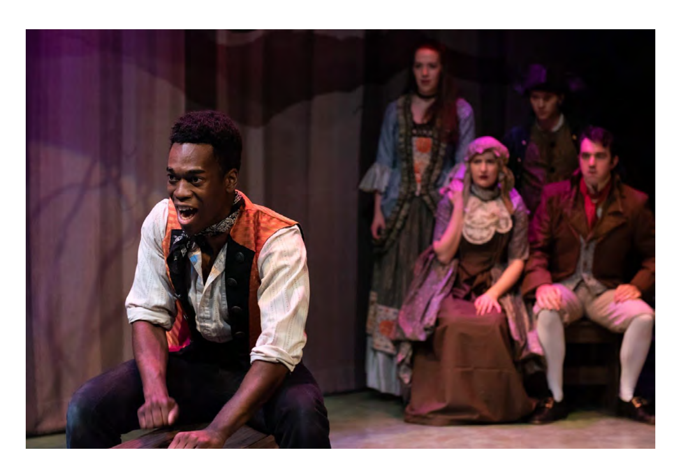
Following the performance, I can leave the theatre or I can go into the lounge where some of the actors will be waiting. I can take pictures with them, ask them questions, and let them know how much I enjoyed the show!