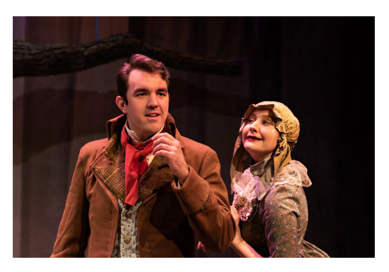
Seeing a play is like seeing a movie. The play will be performed by people right in front of me on stage. They are called actors, and the people they are playing are called characters.