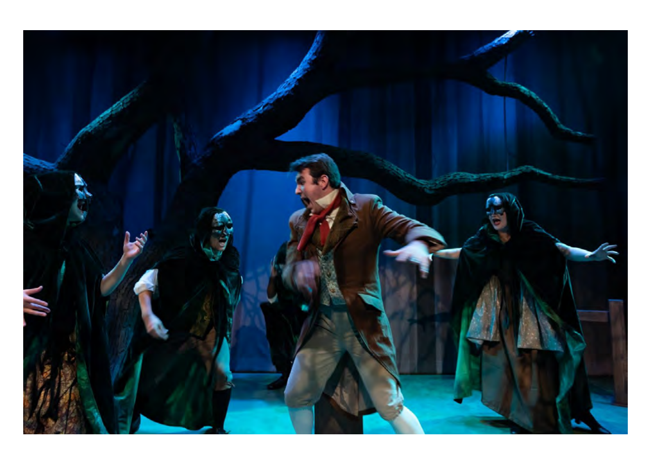
As Ichabod walks home, the spirits of Sleepy Hollow begin to encircle him. Ichabod tries to remain calm, but the spirits successfully frighten him.