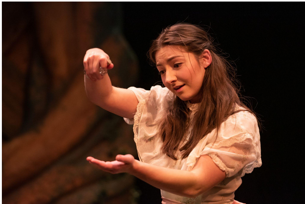
Back at her home, Winnie sees a dog barking at her toad friend. Winnie decides to pour the magical water on the toad, so he will be safe and live forever.