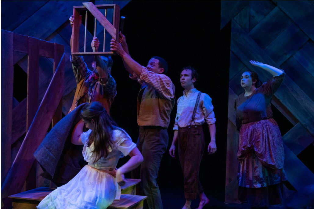
Winnie helps the Tucks set Mae free. The Tucks leave.