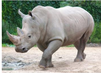
#2 WHITE RHINO