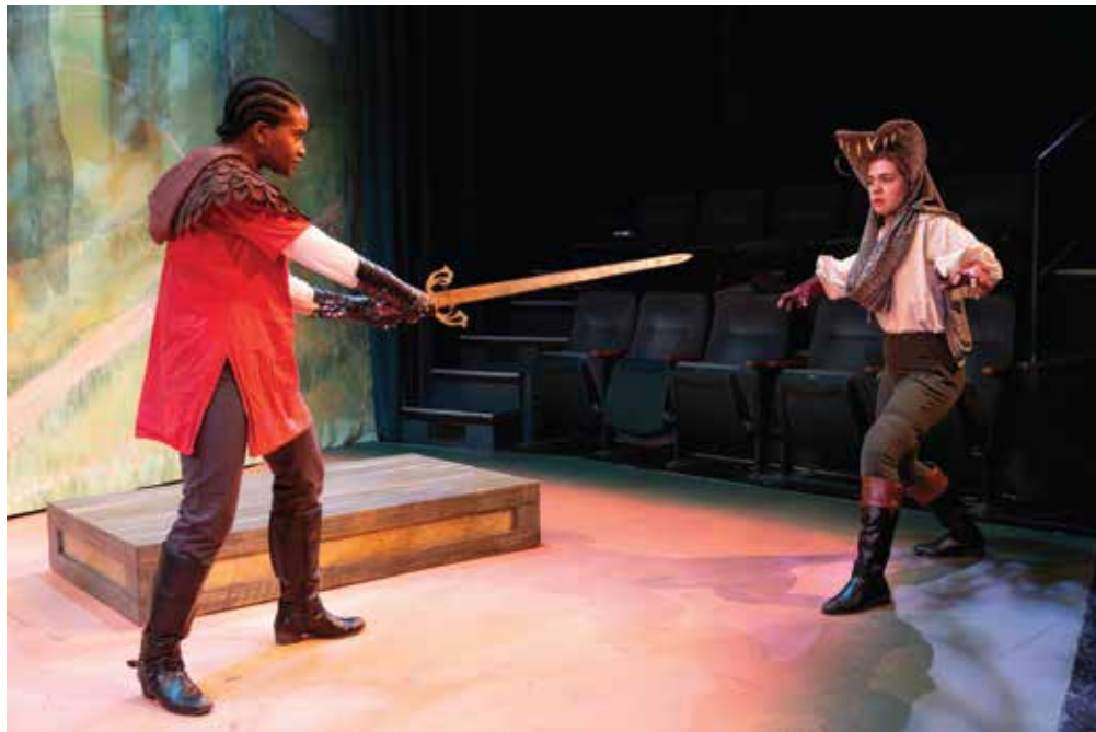
Arthur returns to give the sword to Kay. The challenge is to defeat the Questing Beast. Because Kay is Arthur's family, the Beast refuses to fight. Kay decides to forfeit the tournament because he does not want to kill the innocent Questing Beast.