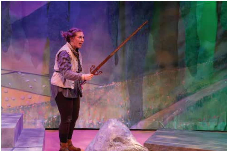
Arthur is able to pull the sword from the stone!